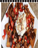
Small $4.95 Large $8.95